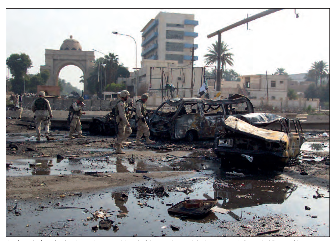
The aftermath of a car bombing in Iraq. The Human Rights unit of the UN Assistance Mission in Iraq systematically records civilian casualties.

Also reflecting ORG's previous findings on the range of approaches, purposes and benefits to casualty recording,<sup>34</sup> the range of different aims and needs in relation to casualty recording in this list was seen in our UNHQ research. The challenge for the UN is to determine how different objectives can be coordinated to ensure effective recording and analysis of civilian casualties in armed conflict (and giving consideration to situations of armed violence more broadly).