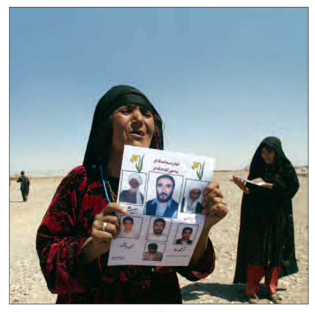
Afghan woman holding a poster of family members killed in an airstrike in 2008. UNAMA HR records civilian casualties and advocates with conflict parties to reduce such civilian harm.

The UN is currently implementing the "Rights Up Front Action Plan", which, amongst other things, is concerned with the improvement of information coordination within the UN. The Action Plan has been developed following the UN's conclusion that it failed in 2009 to advocate effectively with Member States and conflict parties on information about civilian casualties in Sri Lanka, leading to greater civilian suffering. The initiative presents an opportunity to bring about systematic casualty recording in the UN that supports the protection of civilians, as recommended in the 2013 Secretary-General's report on the protection of civilians in armed conflict. This opportunity has not yet been realised, but should not be missed.