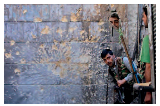
Opposition fighters in Syria. Syria was identified as a context in which casualty figures have not appeared to have enabled or informed consistent action by states.

In the UNAMA HR case, in terms of casualties in Afghanistan becoming a political tool or issue between Member States, the context was a different one to, for example, cases of alleged mass violations of human rights by a government against its citizens and debate over what intervention there should be. Where political dynamics are different locally and internationally, a question for the UN is whether receptiveness to advocacy on civilian casualties could be developed amongst conflict parties through sensitisation where it is not present, and if so how.