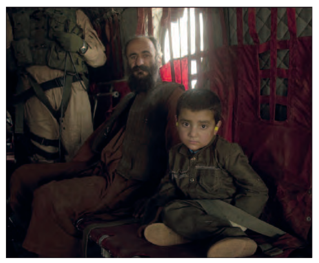
A father and son on a US helicopter, following treatment for injuries from the bombing of a wedding party.

quire support from their home-country publics and politicians. Apart from instrumental considerations, genuine concern for civilian life is also important. Buy-in and willingness were likely major factors in UNAMA HR's contributions to change through advocacy. Some openness to protection and to discussing issues and cases has been key – where operations are covert, action has been far harder (see Box 6 p31). Some interviewees pointed out that UNAMA HR's advocacy being locally focused to Afghanistan and so not requiring as much support from UNHQ also decreased political complications (though the interventions and support of high-profile UN figures have been helpful, and maintaining a spotlight on the issue internationally through the media for example has been important). In other contexts, different factors and pressures may mean that success in this kind of advocacy could be much harder (as discussed in Part 1 in relation to the cases of Syria and Sri Lanka). Political challenges to casualty recording are also discussed in Part 3.