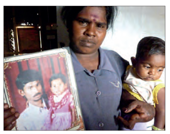
A woman holds a picture of family members killed in the conflict in Sri Lanka. Sri Lanka was identified as a context where UN information about casualties affected a limited response at UNHQ.

and Sri Lanka were viewed as two instances where information on casualties was produced by the UN, but elicited only limited responses by States and the UN itself. Despite this, respondents felt that it was their duty to report and advocate on information that reveals the impact of conflict, including casualty information: acting strategically on credible information was seen as fundamental to work on civilian protection, even though change could not always be achieved as a result.