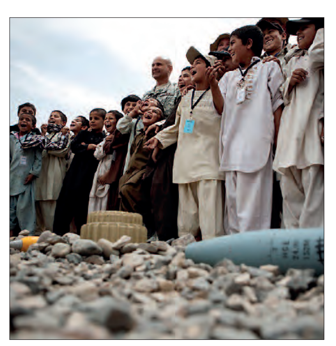
Casualty information can be important to mine action programming, for informing the planning of mine clearance, risk education and survivors' assistance.

There is another fundamental implication of these findings: although minimal information may be needed for particular activities, the application of casualty information into postconflict contexts benefits from the systematic recording of disaggregated information over the course of the armed conflict and beyond. Actors prioritising protection and human rights during conflict may see this as a burden; however, it is a worthwhile consideration towards achieving the post-conflict benefits of casualty recording, including transitional justice and development planning.