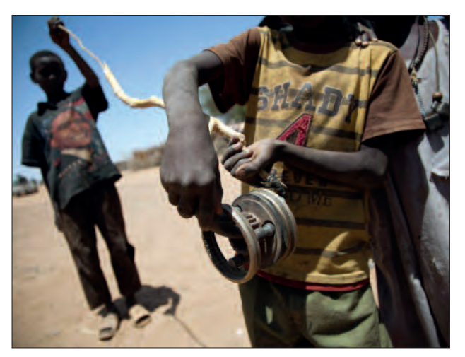
Children play with the remnants of a bomb in Darfur. Darfur was reported as a context in which the casualty information the UN was quoting was not seen as credible.

UNHQ respondents consistently reported reliability and credibility as qualities that information on casualties must have in order to be used. However, there were no formal definitions of these given by respondents that were known to be applicable across UN entities. 112 Important factors shaping perceptions of reliability and credibility included: whether respondents trusted individuals or organisations at field level; whether they knew the process by which information was produced and had confidence that that process was adhered to; or whether, over time, they came to understand that a data-provider, whether UN or NGO, provided material consistently and, if double-checked internally, gave information representative of reality on the ground.