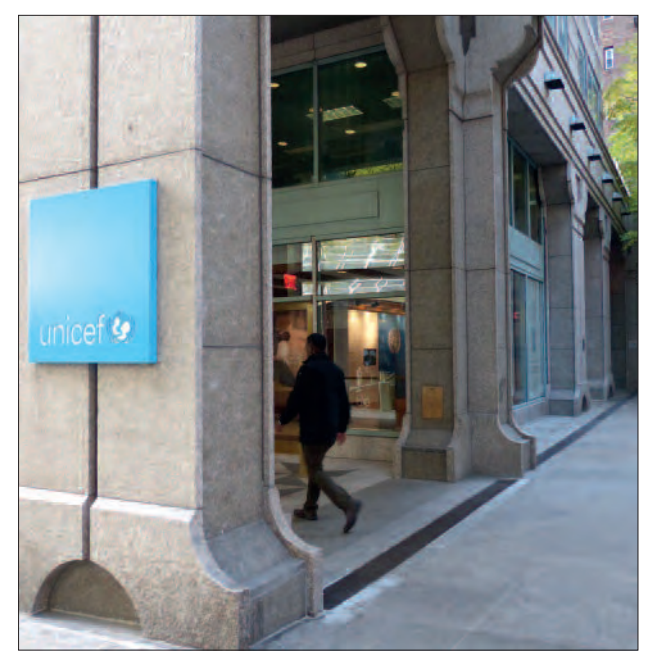
UNICEF in New York. MRM country task forces are always jointly led by UNICEF. These document the killing and maiming of children, but not comprehensively.

Participants to the MRM undertake a case-based approach on violations as per UNSC Resolution 1612, and no claim is made to document deaths of children systematically and comprehensively. As respondents R and A explained, other violations considered within the MRM are privileged, being easier to document in many cases than killing and maiming (due to the difficulty of accessing or verifying information regarding the circumstances of the killing or maiming), and because protection activities focused on other violations are prioritised.