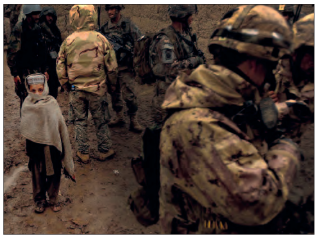
ISAF soldiers in Afghanistan. ISAF gathers data about their operations and their effects on the civilian population, including deaths and injuries.

Though investigations aim to start as promptly as possible – which may be affected by factors such as the security situation – these may take several weeks to finish, or be left open longer where information is inconclusive, as accuracy is prioritised. For the same reason, when new information becomes available this is incorporated into old cases (having undergone the same assessment procedures). The updating of records is a good practice for accurate casualty recording. UNAMA HR also makes sure to follow up on cases of injuries, as these may unfortunately become cases of deaths.