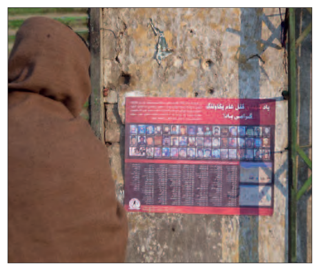
A poster in Kabul listing the names of over 300 people allegedly killed by the Taliban in 2001.

In this context, UNAMA HR, AIHRC, and NGOs documenting specific incidents (such as Human Rights Watch) were seeking to use evidence to change behaviour, particularly on the issue of international forces' airstrikes killing civilians. 2008 was a significant turning point, wherein key documentation and evidence from UNAMA HR on an airstrike in Shindand was reported by respondents to have contributed to changes in a tactical directive on airstrikes (along with the actions and evidence of other organisations and the willingness of ISAF itself to consider this change). UNAMA HR demonstrated publicly that ISAF's reporting on the effects of the attack was incorrect.<sup>98</sup> The policy change on airstrikes was shown by UNAMA HR's data to have subsequently reduced civilian casualties from such incidents. Other ISAF policy changes aimed at reducing civilian casualties can be attributed to similar factors, including ISAF's own casualty tracking and interaction with UNAMA HR and others' evidence-based advocacy.