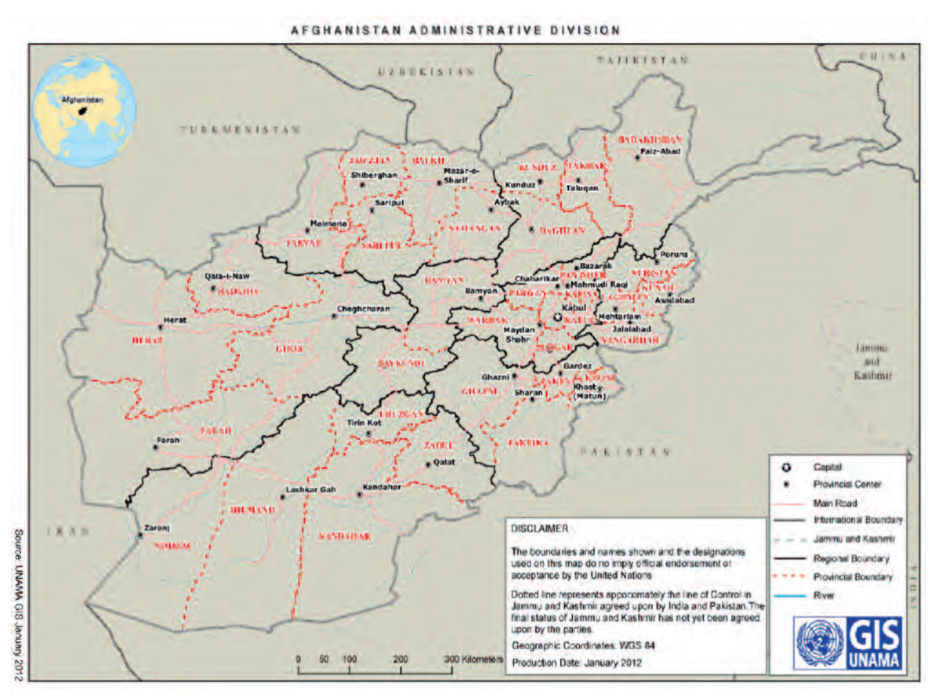
UN map of Afghanistan showing the regional divisions used in UNAMA HR's work. (@ UNAMA GIS January 2012)

66 It wasn't about collecting data, it was about reducing the direct impact of the war on civilians – former UNAMA HR staff, on civilian casualty recording