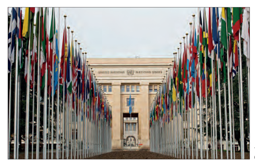
The UN Palais des Nations in Geneva.

Though the authors have gathered external perspectives on the impact and shortcomings of UNAMA HR's work, a limitation of the case study in Part 2 is that many of the details are based on the self-reporting of those who are or have been involved in UNAMA HR's civilian casualty recording.