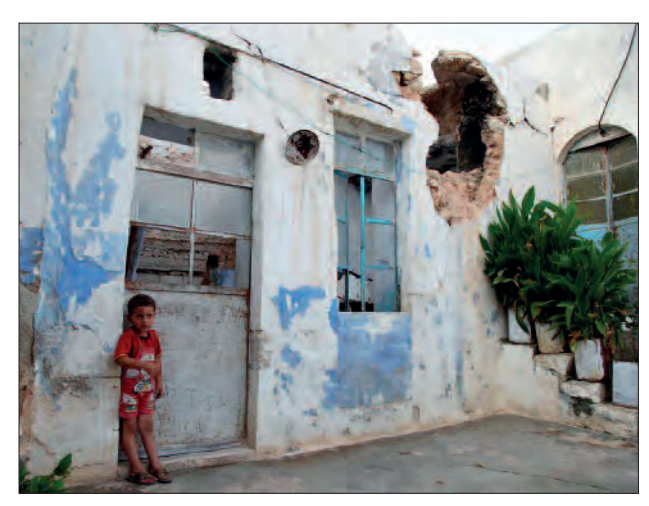
In contexts such as Syria, where the number of casualties is high and access is severely restricted, different procedures for casualty recording may be needed. ORG's report Stolen Futures describes the work of civil society casualty recorders in Syria http://ref.ec/sf

There are several challenging aspects to effectively recording casualties in Afghanistan: security issues, the inaccessibility of certain areas, and difficulties engaging with opposition forces, amongst others. Despite the advantages that UNAMA HR has had in recording casualties, this does not mean that it has been easy or that its success was guaranteed. However, one of the reasons why this report does not recommend that UNAMA HR's system should be directly replicated elsewhere is the question of scaling up this work. As detailed above, UNAMA HR's procedure of verification is strict, and prioritises on-the-ground investigation. In other contexts, higher numbers of civilian casualties and the lack of capacity to investigate these all on the ground could demand a slightly different model, using different ways of getting sources or a different standard of confirmation (for example by dropping the 'three source type verification' requirement in favour of lesser corroboration). This speaks to the concept of a range in casualty recording practice: 110 the same levels of detail and confirmation may not always be possible, but casualty recording can still produce data that is useful. The challenge for the UN, as for any casualty recorder in any given set of circumstances, is to show the value and gain acceptance of the data produced, through demonstrating accuracy and credibility. For this, common standards for casualty recording would be highly beneficial.