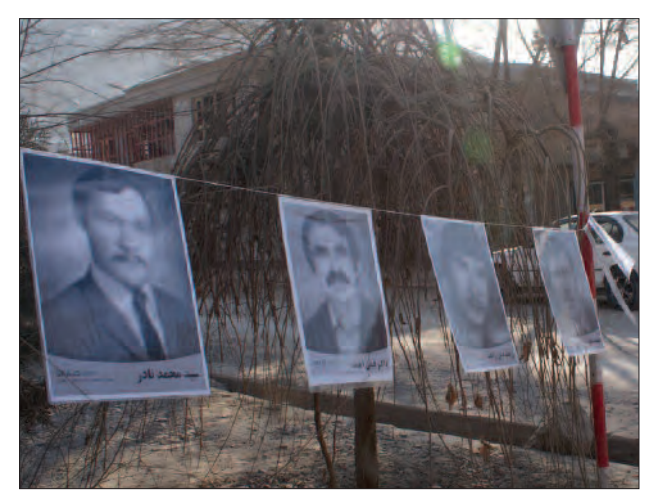
Photo exhibition in Kabul by the Social Association of Afghan Justice Seekers, who campaign for prosecutions for violations and killings, committed during war in Afghanistan since the 1970s.

UNAMA HR's action upon civilian casualty recording intends to decrease the civilian population's suffering from the conflict, improve human rights protection, and build compliance of parties to the conflict with International Humanitarian Law, through reducing casualties and supporting programmes that can assist civilians. This is achieved through advocacy with parties to the conflict to review and revise policy and operational practices, changing their tactics