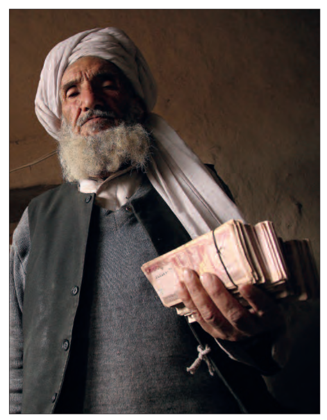
An Afghan man with money he has been offered for relatives killed in a search operation. Information about such incidents is often classified.

UNAMA HR's civilian casualty recording is a system with documented and enforced procedures, as opposed to a combination of ad hoc documentation done by different people who may have different standards: this is one reason why UNAMA HR's civilian casualty recording is an example of good practice. Many UNHQ respondents found it beneficial to understand how information on casualties is obtained as this gives them insight into how they can use such information for their particular work. UNAMA HR's civilian casualty recording methodology is underpinned by a system of guidance and training. One aim of this is to ensure consistency in the data produced, and guidance and training has developed in strength over the lifetime of UNAMA HR's civilian casualty recording. Checking and feedback procedures are part of this guidance. Staff are also given guidance notes, which are documents covering different aspects of how recording should be done. These have developed with the involvement of different staff in the system. 90 Staff are encouraged to seek advice on difficult cases, and guidance given is circulated to all. Training is given on methodology, UNAMA HR's database, and the recording's legal framework, both at HQ in Kabul and in the field. All UNAMA HR staff also meet once