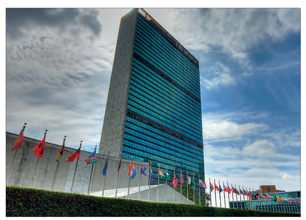
The UN building in New York. Advancing casualty recording would benefit the work of multiple UN entities.

5. Develop UN-wide principles and standards for casualty recording, building from existing standards Following discussions of information needs, UN entities should collaboratively design UN-wide principles that can guide casualty-recording practice, and which would help users and advocacy targets to assess the data produced. These principles might refer, for example, to transparency of methodology, impartiality, and mitigating risk. Standards such as the basic points of information about incidents and individuals killed also need to be set, so that any information produced can be useful to the maximum number of actors. Such standards can influence recording methodologies employed, encouraging good practice. In this process of setting principles and standards, lessons should be taken from examples of good practice, such as that of the Human Rights unit of the UN Assistance Mission in Afghanistan (UNAMA HR) described in Part 2. Oxford Research Group's own process to develop standards with NGO practitioners, drawing from their experiences and good practices, may also be useful, <sup>4</sup> as are existing documents such as the ICRC Professional Standards for Protection Work. The principles and standards developed can also provide a starting point for using casualty information from others such as NGOs in a more effective and standardised way.