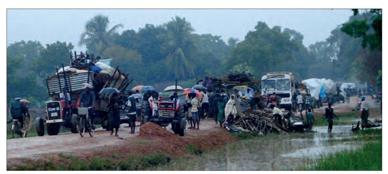
Displaced civilians in Sri Lanka, 2009. The 'Rights Up Front Action Plan' was developed in response to the UN's review of its failure to act effectively on casualty information in this context.

Ultimately, casualty-recording systems deployed by UN actors should reflect the range of needs and purposes articulated by different UN entities; information produced through casualty recording should be made accessible (within the UN, to all who can use it to support their activities, as well as publicly as long as it is safe to do so); and the work should be based on the political and practical lessons already learned by the UN in relation to this issue. In this way, casualty recording can contribute to supporting the needs of, and safeguarding the right to life and protected status, of civilians in armed conflict.