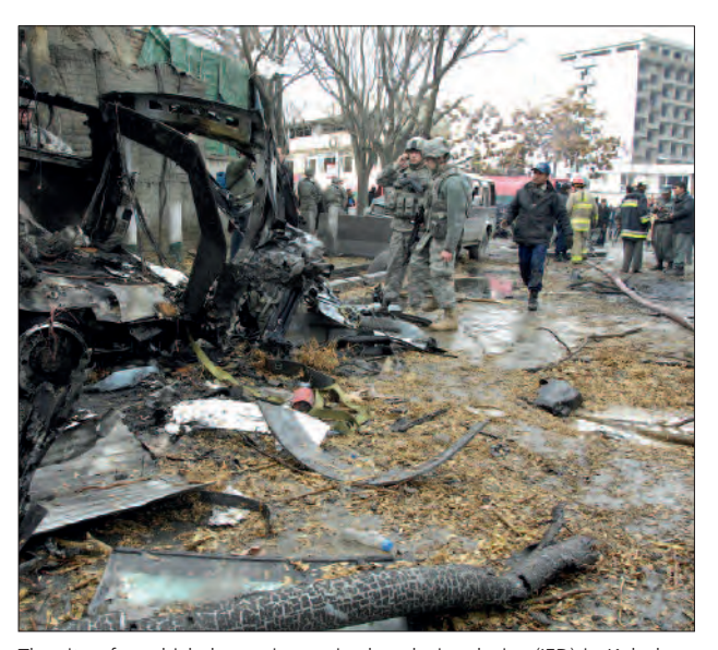
The site of a vehicle borne improvised explosive device (IED) in Kabul.

ty recording aware of this programme, and of other organisations that might assist them. UNAMA HR shares information about casualties with MACCA for their victim assistance activities, and with UNICEF, who are sometimes able to refer victims or families to counselling and other services. UNAMA HR has supported NGO programmes in other ways through their data, for example by sharing information on trends in IED injuries with an NGO bidding for funds to establish a hospital.