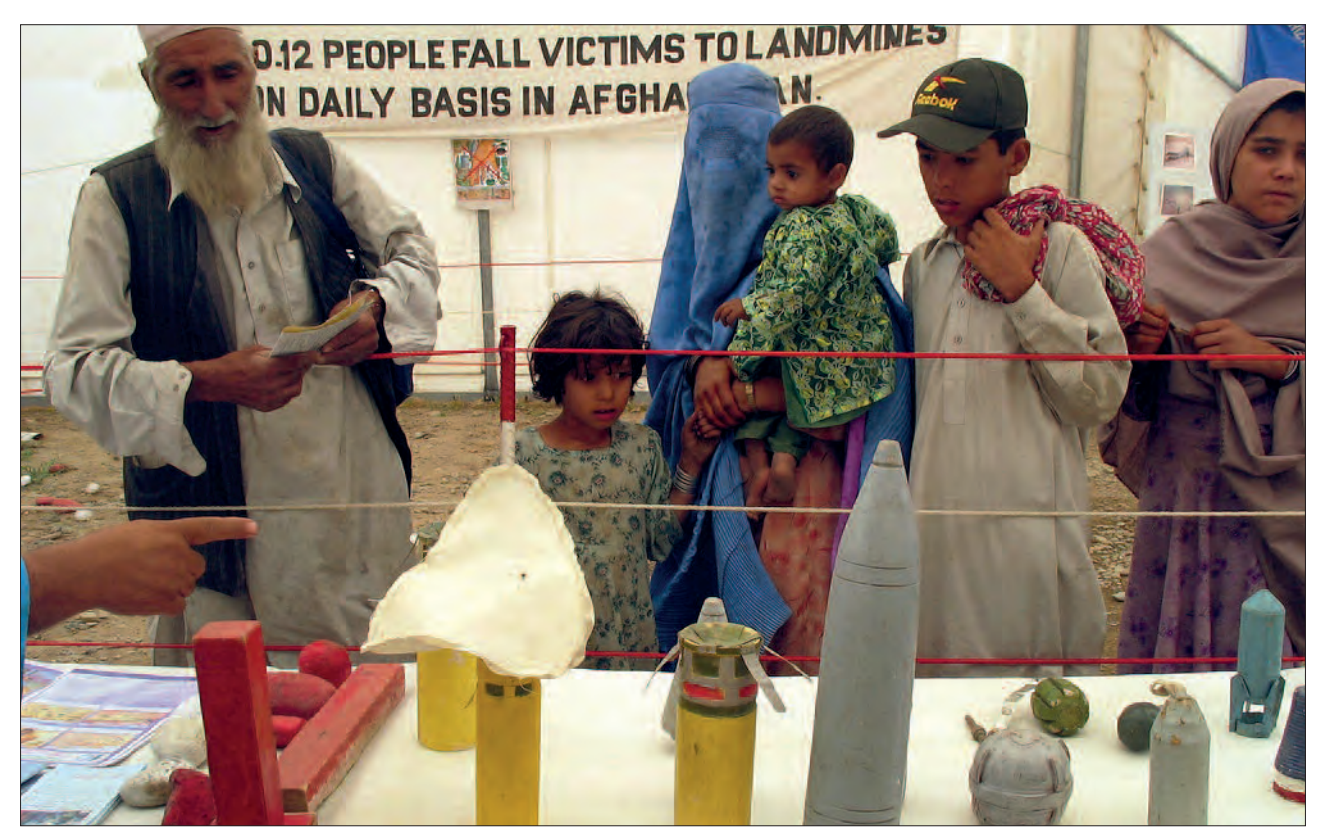
Casualty data is crucial to operational planning for mine action in Afghanistan, including mine and ERW risk education.

Most source information is collected by UNAMA HR locally, but some is also acquired in Kabul, particularly through comparing data with others. Information obtained at Kabul level is sent to the field offices for verification. UNAMA HR never share their database, but aim to 'de-conflict' their data with other specialist programmes in the UN system such as MACCA and the CTFMR for accuracy, ensuring consistent messages from the UN system and stronger joint action. These entities may share lists of cases with or show their databases of investigations to UNAMA HR. Material is never incorporated at face value, but assessed as any other source. It is not a case of copying data from others. Similar detailed data comparison has also been carried out with the AIHRC, and frequently still is at the local level. UNAMA HR's protocols around coordination on casualty data give one model for addressing some of the challenges to implementation and coordination raised in Part 3.